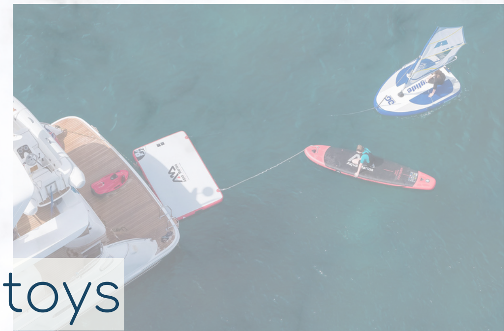
Aft & Water toys